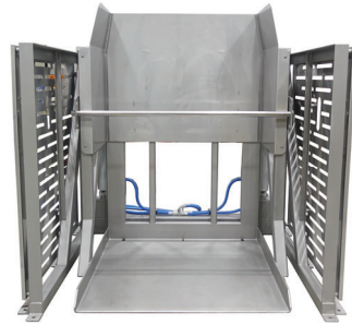
Combo Dumper K#260129 Power Pack K#330071