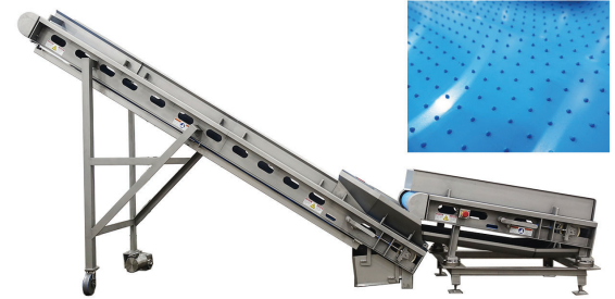
Incline Pivot Conveyor K#770145 Batching Conveyor w/Scale K#770144