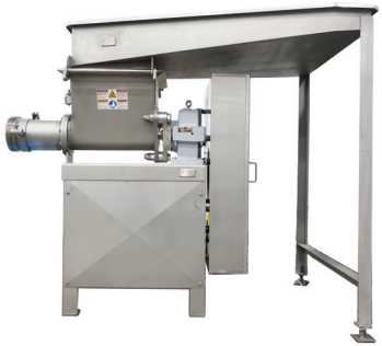
Weiler 878 Grinder K#110097 with Inspection Table K#980047