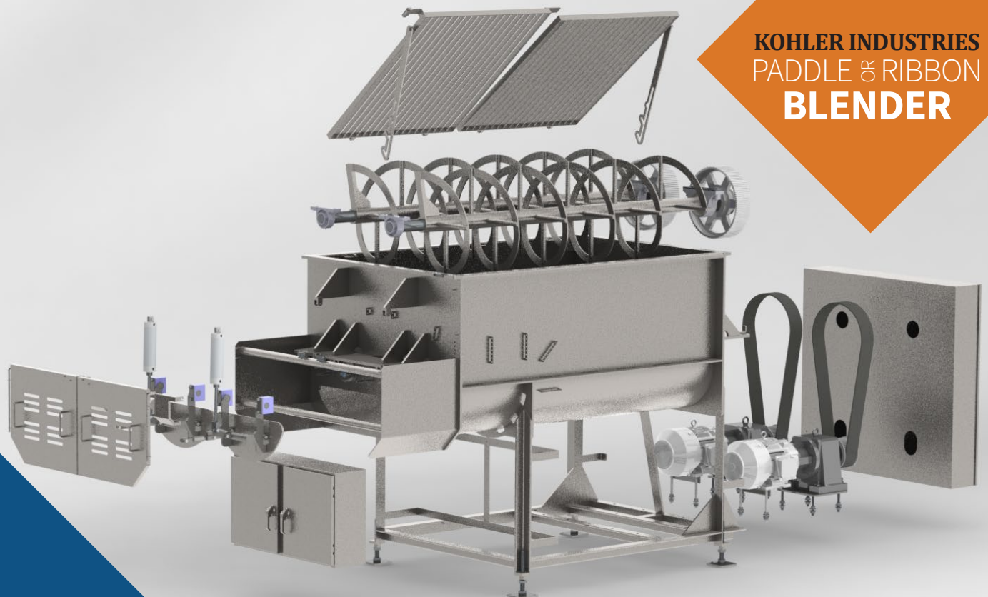
KOHLER INDUSTRIES PADDLE & RIBBON BLENDER

Born in the Midwest, all our equipment is made in the USA to ensure top quality. We oversee every aspect of production.